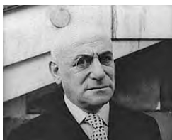
Max Jacob 1876-1944 Painter, poet, writer and critic