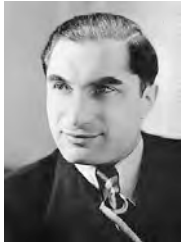
Joseph Schmidt 1904–1942 Actor and Tenor