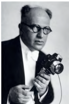
Erich Salomon 1886–1944 Photographer

Born in Berlin, Erich Salomon studied law, engineering, and zoology up to World War I. After the war, he worked in the promotion department of the Ullstein publishing empire designing their billboard advertisements. He first picked up a camera in 1927, when he was 41, to document some legal disputes and soon after hid an Ermanox camera usable in dim light in his bowler hat. By cutting a hole in the hat for the lens, Salomon snapped a photo of a police killer on trial in a Berlin criminal court.