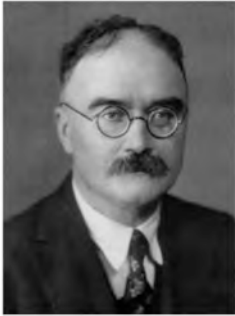
Maurice Halbwachs 1877-1945 Philosopher and sociologist