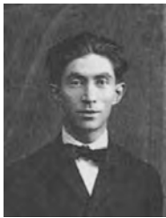
Benjamin Fondane 1898–1944 Philosopher, poet, cultural critic and avant-garde promoter