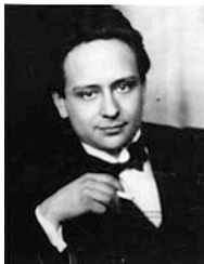
Viktor Ullmann 1898–1944 Composer, conductor and critic