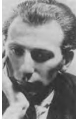
Miklós Radnóti 1909–1944 Poet

Miklós Radnóti was born in Budapest into an assimilated Jewish family. His life was considerably shaped by the fact that both his mother and his twin brother died at his birth. He refers to this trauma in the title of his compilation Ikrek hava ("Month of Gemini" / "Month of the Twins").