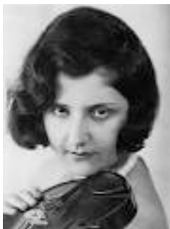
Alma Rosé 1906–1944 Violinist and conductor