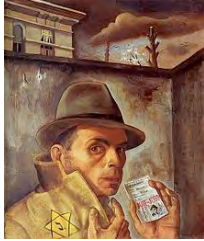
Felix Nussbaum 1904-1944 Painter