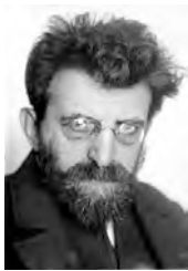
Erich Mühsam 1878-1934 Philosopher, poet and activist

In 1938, he was arrested and deported to Dachau concentration camp. Soon thereafter he was transported to Buchenwald, where he died because of pneumonia he got during an inhuman punishment drill in one of the coldest winters in Europe.