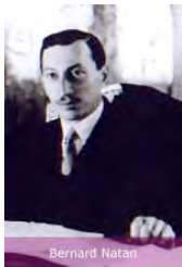
Bernard Natan 1886–1942 Film director, producer and pioneer

Mühsam was arrested on charges unknown in the early morning hours of 28 February 1933, within a few hours after the Reichstag fire in Berlin. Joseph Goebbels, the Nazi propaganda minister, labelled him as one of "those Jewish subversives." It is alleged that Mühsam was planning to flee to Switzerland within the next day. Over the next seventeen months, he would be imprisoned in the concentration camps at Sonnenburg and Brandenburg where he was subjected to various barbarous acts of torture and repeated beatings at the hands of prison guards and officers. On 2 February 1934, Mühsam was transferred to the concentration camp at Oranienburg. The beatings and torture continued, until finally on the night of 9 July 1934, Mühsam was tortured and murdered by the guards, his battered corpse found hanging in a latrine the next morning.