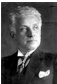
Leon Jessel 1871–1942 Composer and conductor