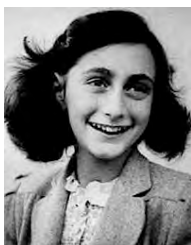
Anne Frank 1929–1945 Diarist