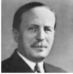
René Blum 1878–1942 Theatrical impresario, journalist and art critic

René Blum, was a French theatrical impresario, was the founder of the Ballet de l'Opéra at Monte Carlo and was brother of French Prime Minister Léon Blum. Blum became a journalist and art critic for the newspaper "Gil Blas." He discovered writers and avant-garde painters and in 1913, publishes Du côté de chez Swann by Marcel Proust (unknown at the time).