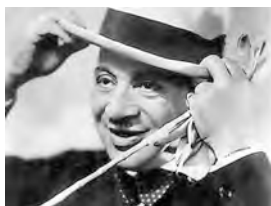
Fritz Grünbaum 1880-1941 Cabaret artist, operetta and pop song writer, director, actor and master of ceremonies

Shortly after the war, one of Grynszpan's original lawyers reported that the youth had been executed by the Nazis after his transfer into their hands in 1940. Herschel Grynszpan's parents survived the war and later immigrated to Israel. They played a part in the trial of Adolf Eichmann in Jerusalem, and Herschel's father and brother testified that all their previous efforts to find Herschel had failed. Nevertheless, as the Grynszpan family told the Jerusalem Post in 1988: Herschel's act was one of the first expressions of Jewish resistance to the Nazis.