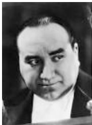
Kurt Geron 1897–1944 Actor

In 1940, Gebirtig wrote the song "S'tut vey" ('It Hurts'), feeling shattered by the absence of solidarity of all Polish citizens against the Nazi invaders. The song is directed against those Poles who laughed when German soldiers humiliated and tortured old Jews in the streets of Krakow. Gebirtig's song expresses what most Jews have always felt and what courageous Poles like Jan Blonski have clearly said on this painful subject: the Poles could not have saved the Jews from their fate and are not responsible for that fate, but they could certainly have shown more compassion to the Jews in their agony. On the infamous "Bloody Thursday" of June 4, 1942, Gebirtig's life was ended by a Nazi bullet in the Kraków Ghetto.