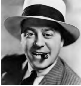
Paul Morgan 1886-1938 Actor

Austrian Actor Paul Morgan (Paul Morgenstern) was born to an Austrian-Jewish family but was baptized and raised Catholic. One of the great theatre stars of the Weimar republic, he co-founded the illustrious Berlin cabaret Kadeko and made more than 100 films. Despite invitations from Hollywood Morgan refused to leave his homeland until it was too late. He did not want to leave, hoping, like so many, to ride out what was thought to be a temporary right-wing government.