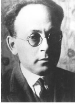
David Vogel 1891–1944 Poet

Modernist Hebrew poet David Vogel was born in the town of Satanov, Podolia, in the Russian Pale of Settlement on May 15, 1891. Like many, he moved west to the big cities. In 1909 or 1910, he arrived in Vilna as a yeshiva student, earned a living as a synagogue caretaker and worked to improve his Hebrew. It was in this period that he had the affair with a mother and her daughter (that he fictionalized in “Viennese Romance”). In 1912, he went to Vienna and lived a life of loitering and cafes. He learned German and barely eked out a living by giving Hebrew lessons. His diary, coupled with testimonies of people he met, suggests that he was introverted and reticent, a stranger to the practicalities of life, so he constantly suffered from want and hunger.