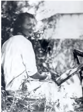
Charlotte Salomon 1917–1943 Artist