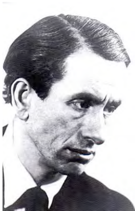
Hans Krása 1899–1944 Composer