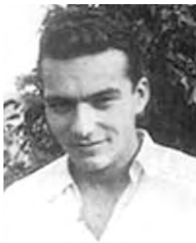
Jura Soyfer 1912–1939 Writer and satirist