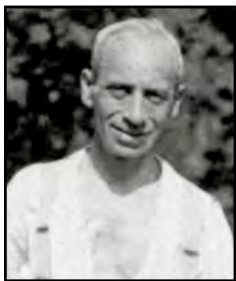
Mordechai Gebirtig 1877–1942 Composer

Mordechai Gebirtig (1877–1942) was born in Krakow and lived in its Jewish working-class quarter all his life. He was self-taught in music, played the shepherd's pipe well, and tapped out tunes on the piano with one finger. He earned his livelihood as a furniture worker; music and theatre were avocations.