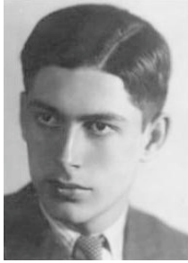
Gideon Klein 1919–1945 Composer

Gideon Klein was born in Prerov, Moravia, on 6 December 1919. His family, rooted in Jewish tradition, was also modern in outlook and supportive of culture and art.