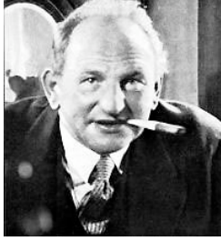
Egon Friedell, PhD 1878–1938 Playwright, librettist and essayist

Egon Friedell was born in Vienna to Jewish parents but converted to the Lutheran faith in 1897. He received his Doctorate in philosophy at the University of Heidelberg.