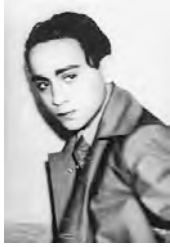
Herschel Grynszpan 1921–1943/1945 Resistance Hero

He was deported to a labour camp in Koenigs Wusterhausen and stayed there until 16 April 1945. Ill and exhausted, he was shot by Nazis during a forced death march, still holding on to his camera.