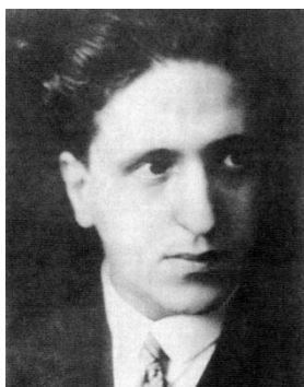
Pavel Haas 1899–1944 Composer