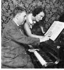
Erwin Schulhoff 1894–1942 Composer and pianist