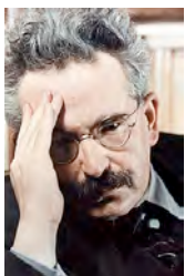
Walter Benjamin 1892–1940 Literary critic, philosopher, social critic, translator, radio broadcaster and essayist

On 15 May 1942, the Nazis deported him to Izbica. He was killed on 10 or 11 July 1942 in the Majdanek/Lublin concentration camp.