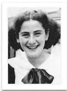
Selma Meerbaum-Eisinger 1924–1942 Writer, poet and translator

On 17 October 1942, he was deported to the Monowitz concentration camp near Auschwitz. The circumstances of his death have been described by Raul Hilberg in The Destruction of the European Jews : During an inspection by several board directors of the IG Farben syndicate around Otto Ambros, Fritz ter Meer, Carl Krauch and Heinrich Bütelfisch, the already diseased Löhner-Beda was denounced as working not hard enough, wherefore he was beaten to death on 4 December 1942. A Kapo accused of the murder in the 1968 Frankfurt Auschwitz Trial was acquitted of the charge due to lack of evidence.