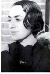
Dora Gerson 1899–1943 Singer and actress

Born Dorothea Gerson in Berlin, Gerson began her career as a touring singer and actress in the Holtorf Tournee Truppe alongside actor Mathias Wieman in Germany where she met and married her first husband, film director Veit Harlan. The couple married in 1922 and divorced in 1924. Harlan would eventually direct the highly anti-Semitic Nazi propaganda film Jud Süß (1940) at the insistence of Nazi Propaganda Minister Joseph Goebbels. Harlan's niece later married filmmaker Stanley Kubrick.