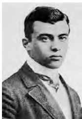
Jakob van Hoddiss 1887–1942 Expressionist poet

Jakob van Hoddiss (May 16, 1887 in Berlin – 1942 in Sobibor) was the pen name of a German-Jewish expressionist poet Hans Davidsohn, of which name "Van Hoddiss" is an anagram.