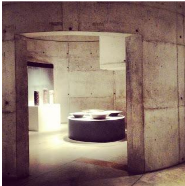
This little piece of mine was up in the gallery when I got there! (yeah!)