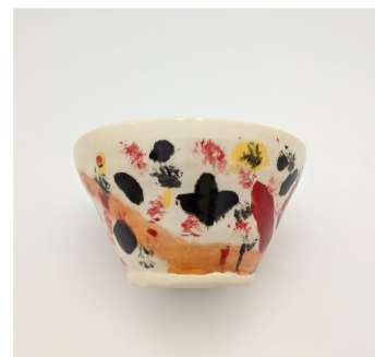
Hand thrown bowls painted by members of the Alzheimer Society of Waterloo Wellington