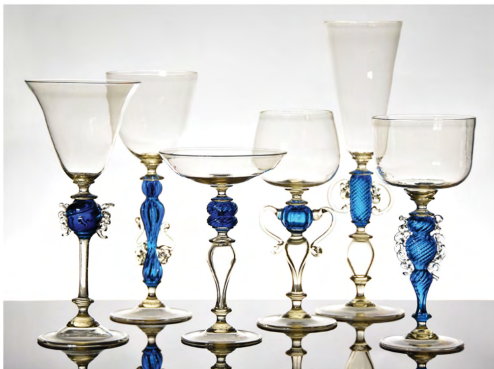
Charlie Larouche-Potvin, Straw and Blue Set , Blown glass, 2022. Collection of the Artist.