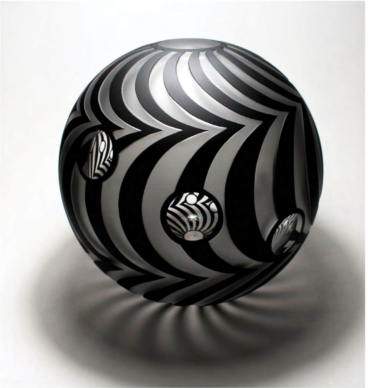
Jared Last, Reflector Series (sphere, off axis), Glass, 2021. Collection of the Artist.