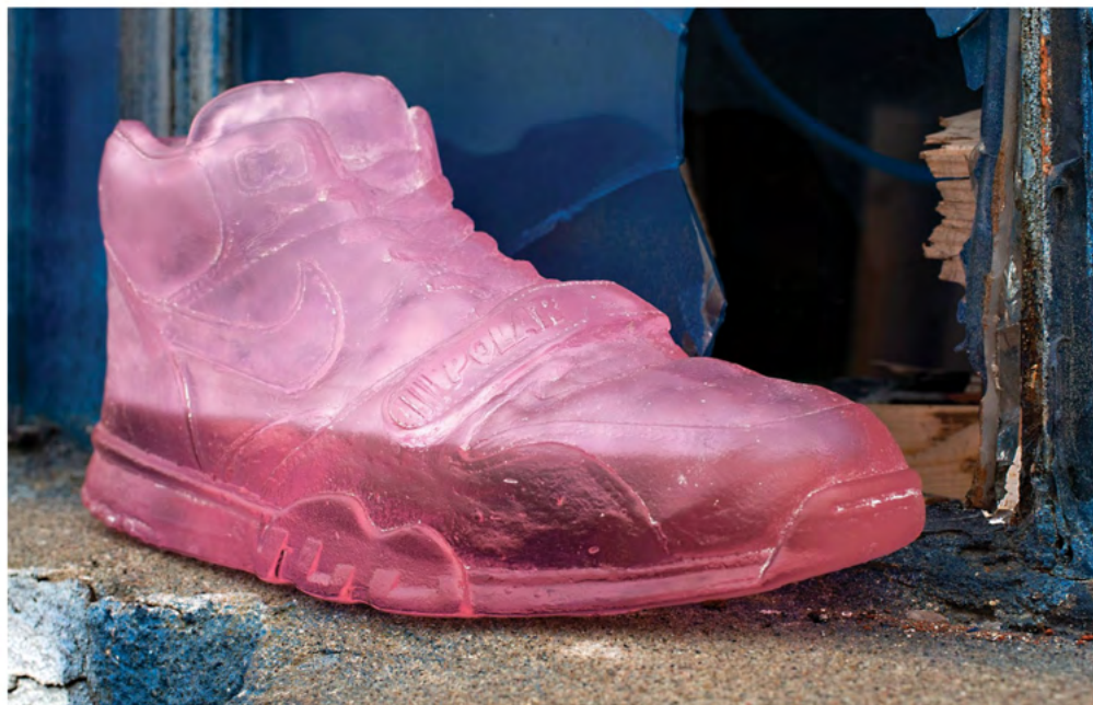
Jeanne Létourneau, Chaussure N.04 de la série Objets et Reliques , Crystal, pâte de verre, 2021. Collection of the Artist.