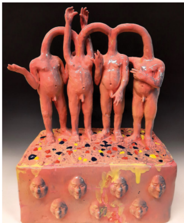
Matthew O'Reilly, Connected #4 , Ceramic, acrylic, 2022. Collection of the Artist.