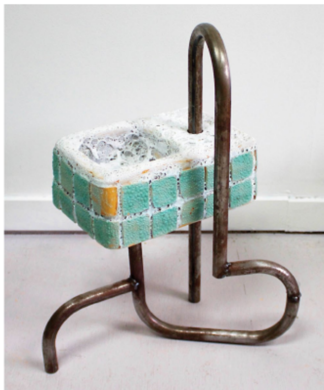
Rebecca Ramsey, Sink , Stoneware, glaze, iron, 2022. Collection of the Artist.