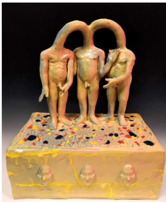
Matthew O'Reilly, Connected #3 , Ceramic, acrylic, 2022. Collection of the Artist.