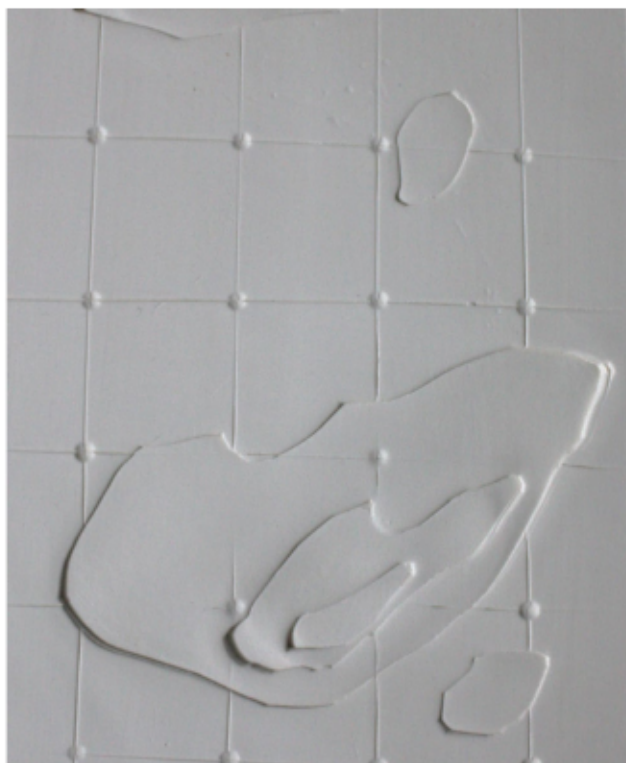
Alana MacDougall, Form XVI , Porcelain, 2021. Collection of the Artist.