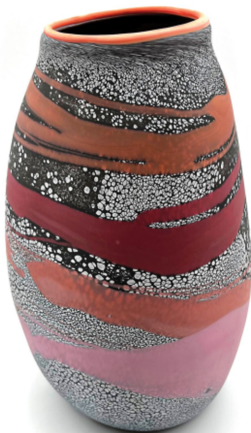
Nadira Narine, Woven Series . Glass. 36 x 13 x 10 cm. Collection of the artist.