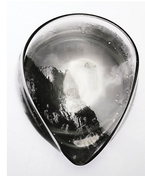
Leia Shijie Guo, Wishing Well #1 , 2023. Silver gelatin photographic print on blown glass vessel. 25 x 23 x 10 cm. Collection of the artist.