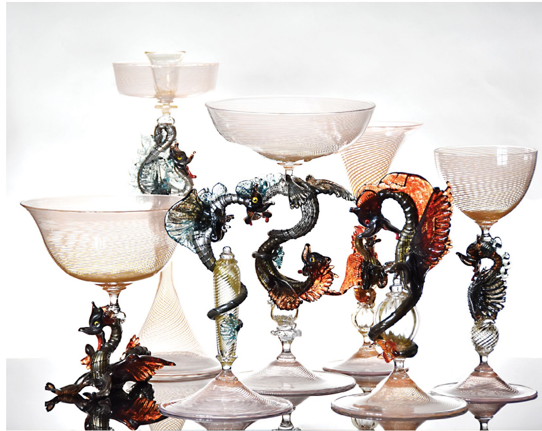
Charlie Larouche-Potvin, Vestiges d'un empire flamboyant , 2022. Glass, 24K gold leaf, silver leaf. 90 x 35 x 34cm. Collection of the artist.