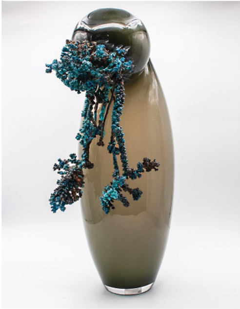
Gordon Boyd, Trying to Heal , 2024. Blown glass, copper (patinated), 33 x 12.7 cm. Collection of the artist.