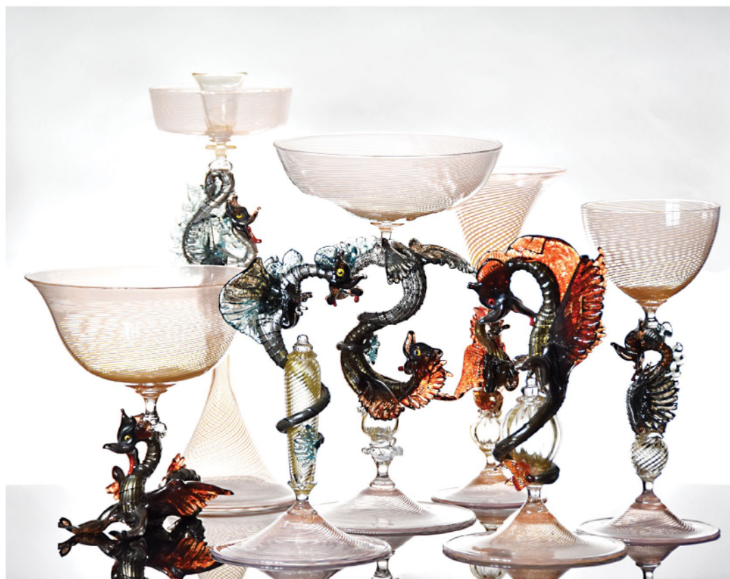
Charlie Larouche-Potvin, Vestiges d'un empire flamboyant , 2022. Glass, 24K gold leaf, silver leaf. 90 x 35 x 34cm. Collection of the artist.