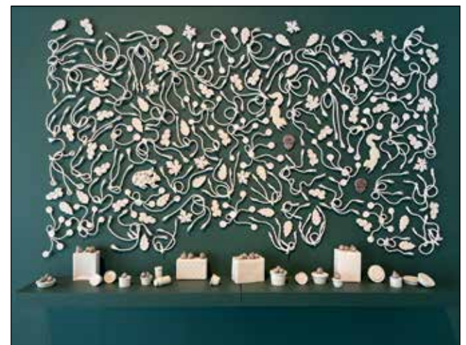
"Les herbes de passage (Écureuils)" – which translates roughly as "passage grasses (squirrels)," 2020, by Amélie Proulx.